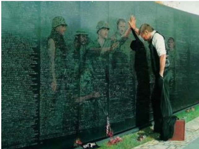
God Bless Our Military Women And Men.